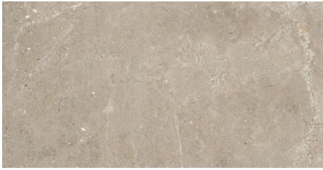
CARDIGAN BEIGE 62X120 - 24,4"X47,2"