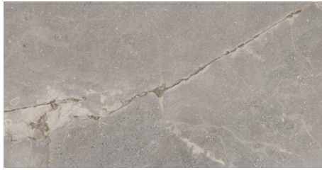
CARDIGAN GRIS 62X120 - 24,4"X47,2"