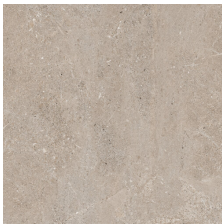
CARDIGAN BEIGE 58X58 - 22,8"X22,8"